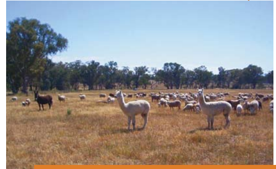
The TAFE farm has found alpacas, with a donkey as back up, highly effective at protecting their mob of sheep from dogs.

Success breeds success; after struggling with low student numbers in the early days the course is now booked to the hilt and the